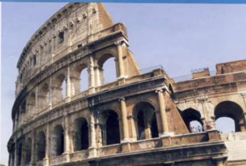
Colosseum Rome, Italy

No place integrates its past into the present quite like Rome, where history comes to life. Explore the world's most famous arena on your sightseeing tour to the Colosseum. Here, you can almost hear the stamping feet of the crowds gathered for gladiatorial combat. Nearby, the Forum Romanum marks the former heart of the Roman Empire. Julius Caesar gave many of his great political speeches there. On your visit to the Vatican City, marvel at Michelangelo's breathtaking ceiling in the Sistine Chapel and look out for the colorful uniforms of the Swiss Guard, protectors of the Vatican City. Before you say "arrivederci," toss a coin into the Trevi Fountain to ensure a return trip to the Eternal City.