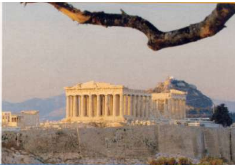
Acropolis Athens, Greece

Discover the ancient city named for Athena, goddess of war and wisdom. Your local guide will lead you up to the Acropolis to view the Parthenon, perhaps the world's greatest architectural feat. See the Temple of Athena Nike, which once housed a gold statue of the goddess, her wings clipped to prevent her from deserting the city. Snap a picture of the Presidential Guard in traditional costume, then, pass the stadium that hosted the first modern Olympics in 1896. A walking tour will take you by Hadrian's Arch and the Temple of Olympian Zeus, built in 515 B.C. to honor the most powerful of all Greek gods.